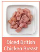
Diced British Chicken Breast